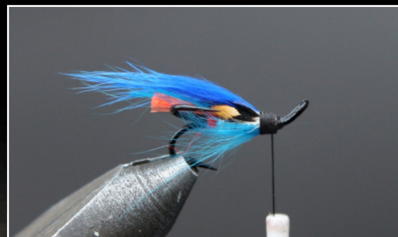
5. Ad Jungle Cock.