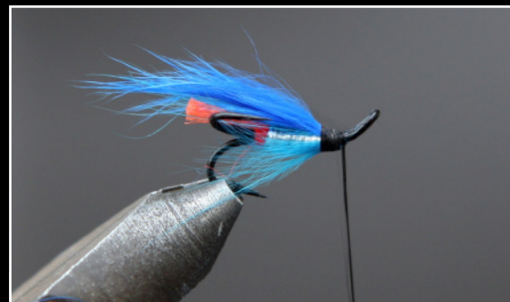
5. Upper wing, King Fisher Blue Rabbit. Notice, not a zonker strip!