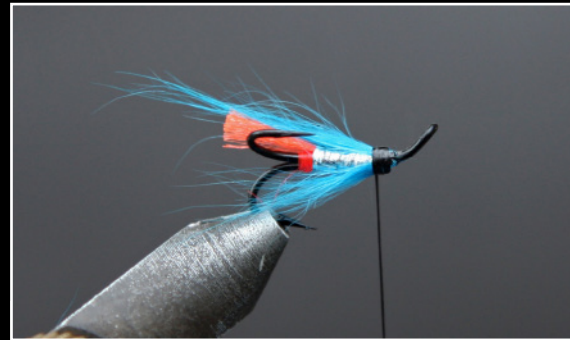
4. Underwing and throat of turquoise Artic Fox.