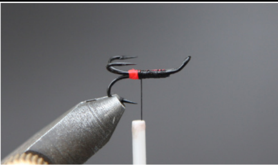
1. Make a little fluoro bright red butt.