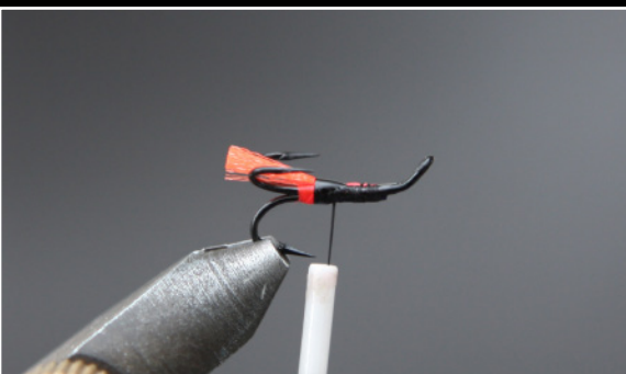
2. Ad a fluoro bright red crystal fiber tail.