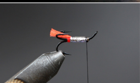
3. Make a silver body